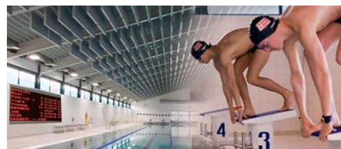
Left: Pieter van den Hoogenband Stadium Eindhoven Middle: Hotel Eindhoven Right: Inno Sport Lab Eindhoven